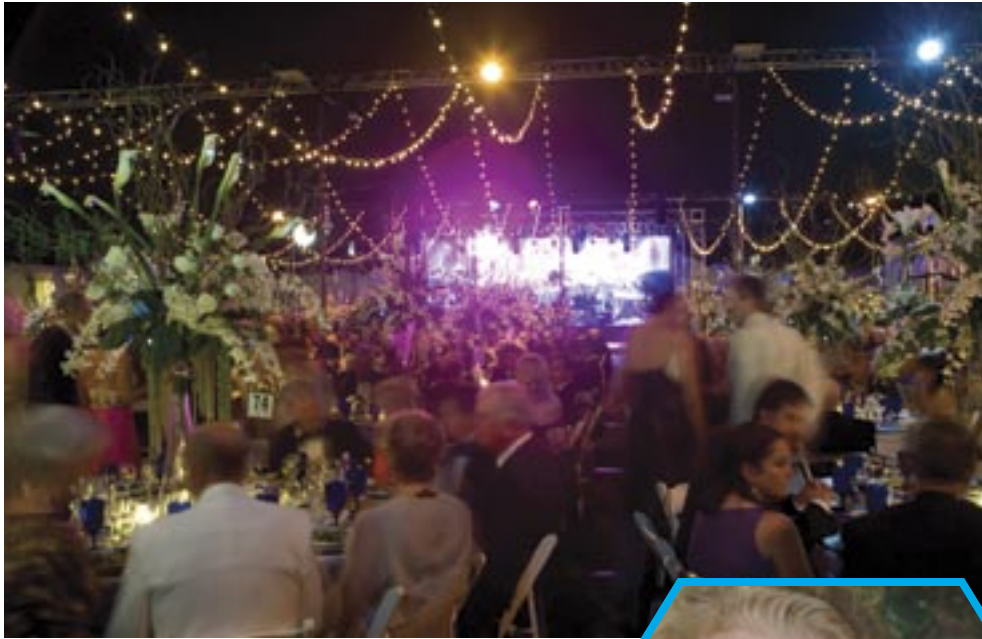
Jewel Ball 2005, Wrapped in Moonlight

Since 1946 we've learned a thing or two about throwing a hot party.